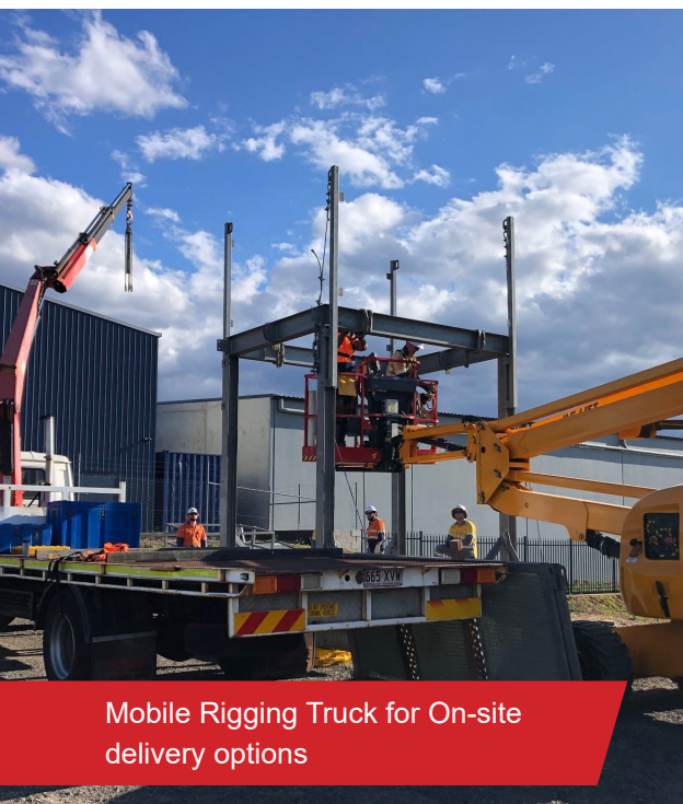
Mobile Rigging Truck for On-site delivery options