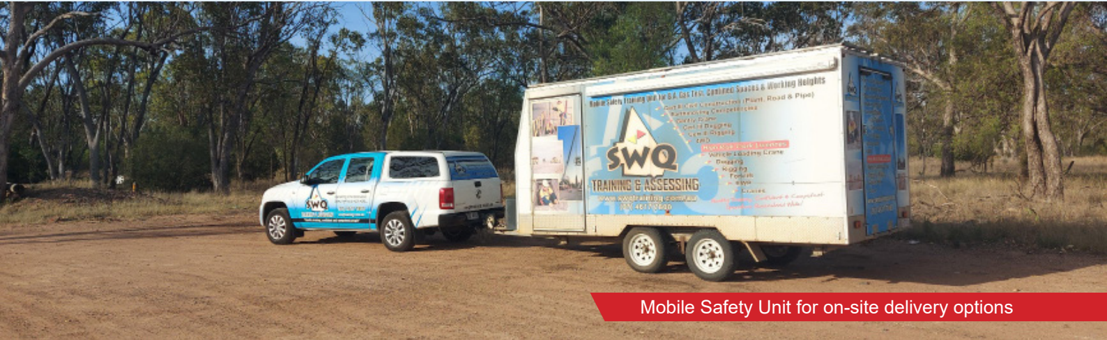
Mobile Safety Unit for on-site delivery options